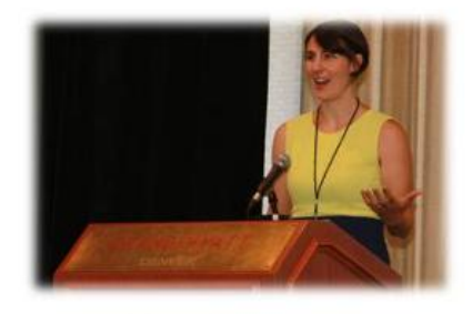
Thank You Colorado ESC Chapter — the 2013 ESC Market Transformation Conference