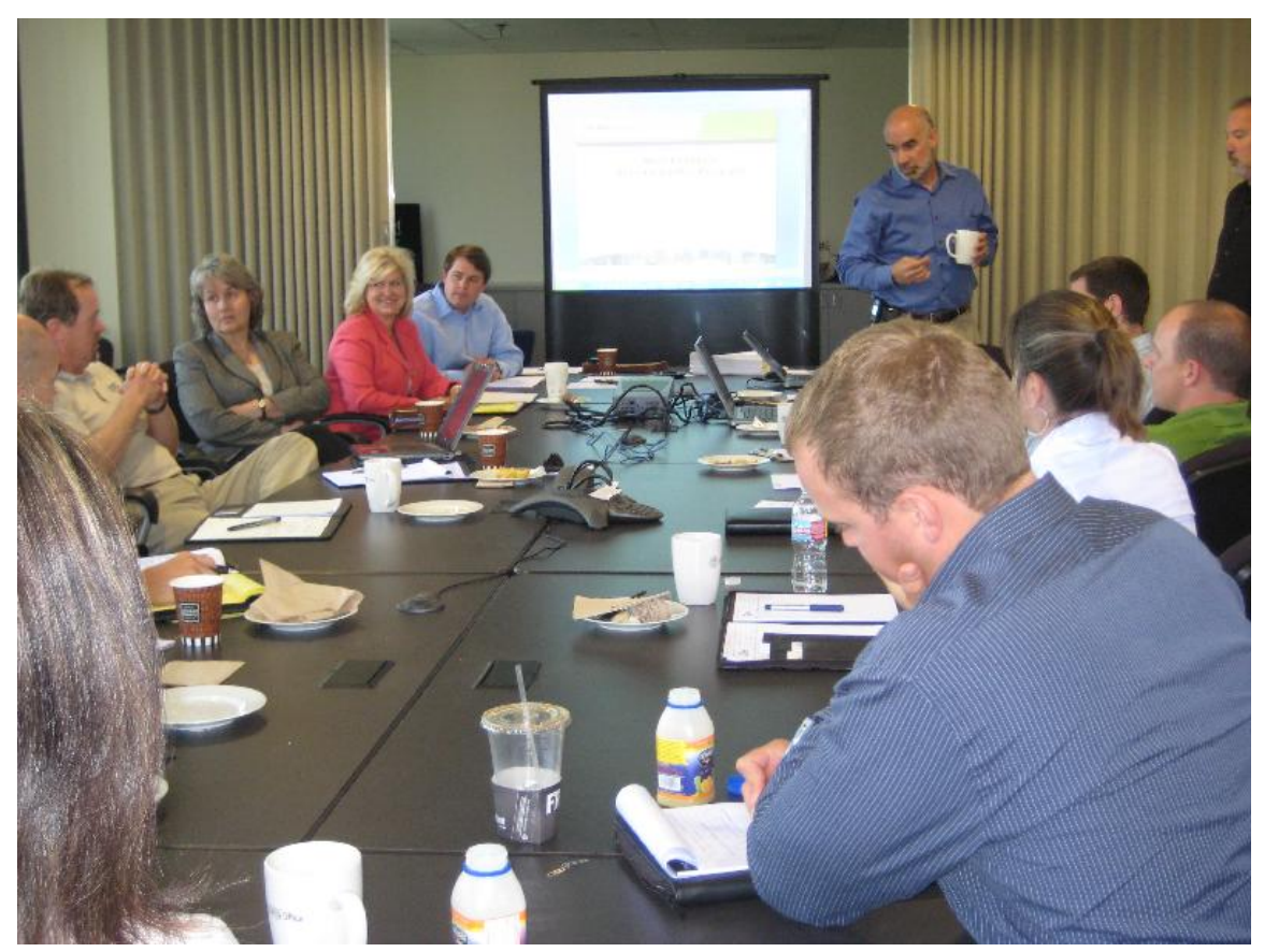
Colorado ESC Chapter meeting circa 2011.

Energy Services Coalition | www.energyservicescoalition.org