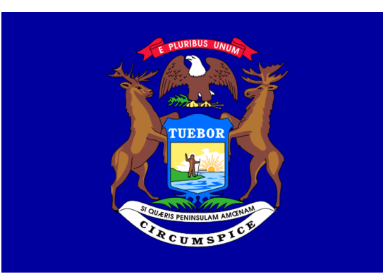
Race to the Top Update: Michigan reports new GESPC investment totals of $226,979,029.

Visit the <u>Michigan ESC Chapter Facebook</u> page for more info and an update on the 5th Annual Michigan ESC Awards Banquet.