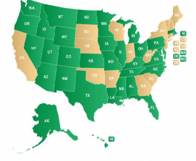
American Samos | Guam | Northern Mariana Islands | Puerto Rico | Virgin Islands

To see the amount of Guaranteed Energy Savings Performance Contracting (GESPC) investments in state and local buildings in a particular state, <u>click here</u> for the ESC state map. The amounts listed are based on the information that has been provided by the states. States with out-of-date or missing data are encouraged to contact ESC at <u>info@energyservicescoalition.org</u> to have your data added or updated.