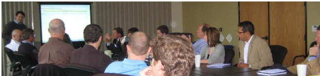
Colorado ESC Chapter Meeting March 2010

Colorado ESC Chapter: With plans to put on a workshop this fall, the Colorado ESC Chapter is hiring two student interns for the summer to help with workshop planning and to provide the student an inside public and private view of the performance contracting industry. The students also will work on a plan to introduce the industry to Colorado's universities, mainly engineering departments.