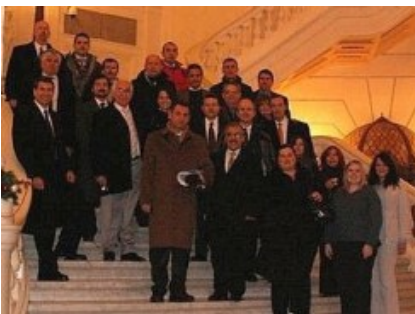
A delegation from Turkey met with DGS staff to learn more about the program, posing here in the Capitol's Rotunda.

On top of all this, DGS is pioneering a parallel program to establish Power Purchase Agreements ( PPAs ) to install and lease renewable energy systems. The GESA model will be customized for this use and companies will be pre-qualified to provide this service.