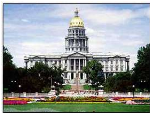
Colorado State Capitol Building